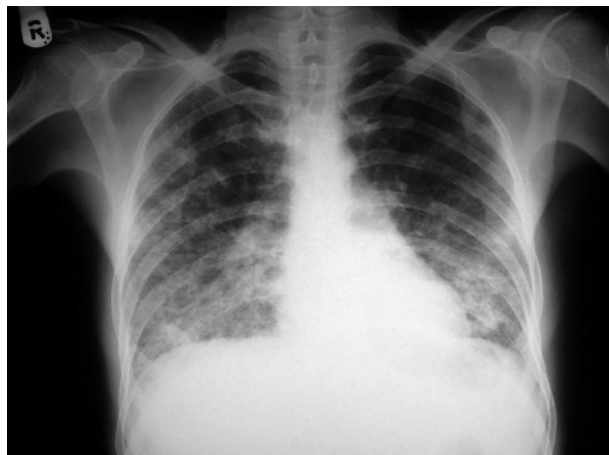
Figure 1 Chest radiograph showing diffuse parenchymal infiltrates attributable to bleomycin pulmonary toxicity.

extrinsic allergic alveolitis (EAA) or non-specific interstitial pneumonia (NSIP), and predict a better response to treatment.