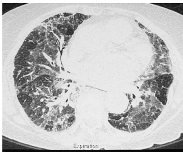
Figure 3 High resolution computed tomography showing ground-glass opacities and areas of decreased attenuation and air trapping in extrinsic allergic alveolitis.

Pulmonary involvement is common in the connective tissue diseases and is not confined to parenchymal disease but spans the range of lung disease. 33 Thus, for example, obstructive airways disease and bronchiectasis occur in rheumatoid disease, pleural effusions occur in systemic lupus erythematosus and rheumatoid disease, respiratory muscle weakness may complicate polymyositis, and pulmonary hypertension is an important cause of death in some forms of systemic sclerosis. All of the different histopathological patterns of ILD, such as UIP, NSIP, LIP, COP, occur in association with the connective tissue diseases and more than one pathology may be present in an individual patient. 33 The prognosis and response to treatment is significantly better in UIP associated with a connective tissue disease than in UIP associated with IPF. HRCT or gas transfer measurements frequently detect sub-clinical ILD in patients with connective tissue disease, but this may be non-progressive and may not require treatment, although careful monitoring is needed. ILD may precede the systemic manifestations of a connective tissue disease and measurement of autoantibodies may be helpful. In systemic sclerosis Scl-70 antibodies are associated with ILD whereas anticentromere antibodies are associated with pulmonary vascular disease, and Jo-1 antibodies are associated with ILD in polymyositis. 33-35